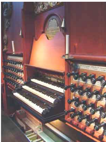
St Bavo, Harlem

Keep contact with the keys and notice that in doing this the ornaments become easier to play.