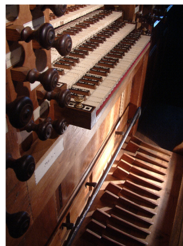
Gottfried Silbermann - France

http://www.youtube.com/watch?v=- apIrjK5mUw